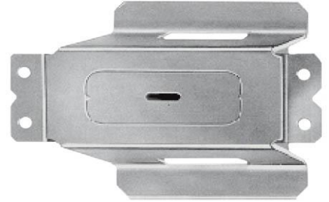
# 81 Concrete Insert

Recommended Heavy gauge insert box is nailed to concrete form. When concrete has set, knock out plug can be removed and insert nut installed. Side openings accommodate up to 1/2" reinforcing rods.